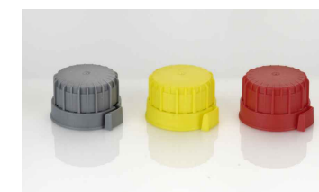
Refill caps Several colours available.