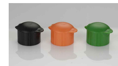
Flip top caps Several colours available.