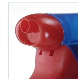
Foam V200 15 ± 3 mm 30°/50°