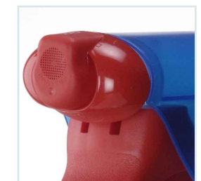
Foam V300 6,5 ± 2 mm 17°/20°