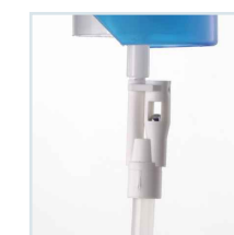
Multidirectional pre-compressed configuration