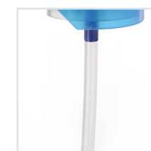
Conventional pre-compressed configuration