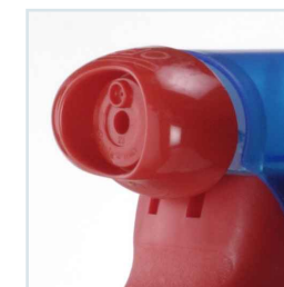
Spray 16 ± 3 mm 85/105 µm 35°/55°